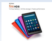
Amazon Fire 8 HD Tablet

Personalized support package that is designed to help cancer patients with gifts that provide relaxation and distraction during cancer treatment. Please choose any 3 items below as your personal gift.